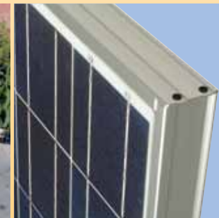
Sharp multi-purpose modules offer industry-leading performance for a variety of applications.